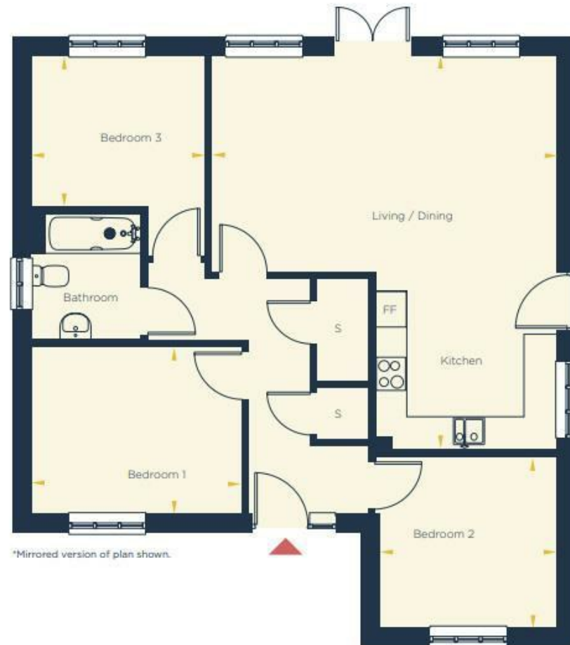
*Mirrored version of plan shown.

VIEWINGS ARE BY APPOINTMENT ONLY – contact us today to book your viewing!